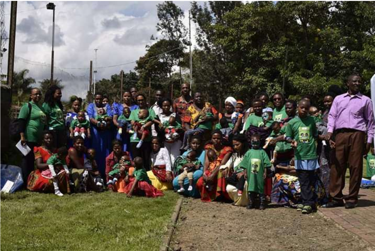
Participating parents with the Cerebral Palsy and Autism Children at the Awareness seminar