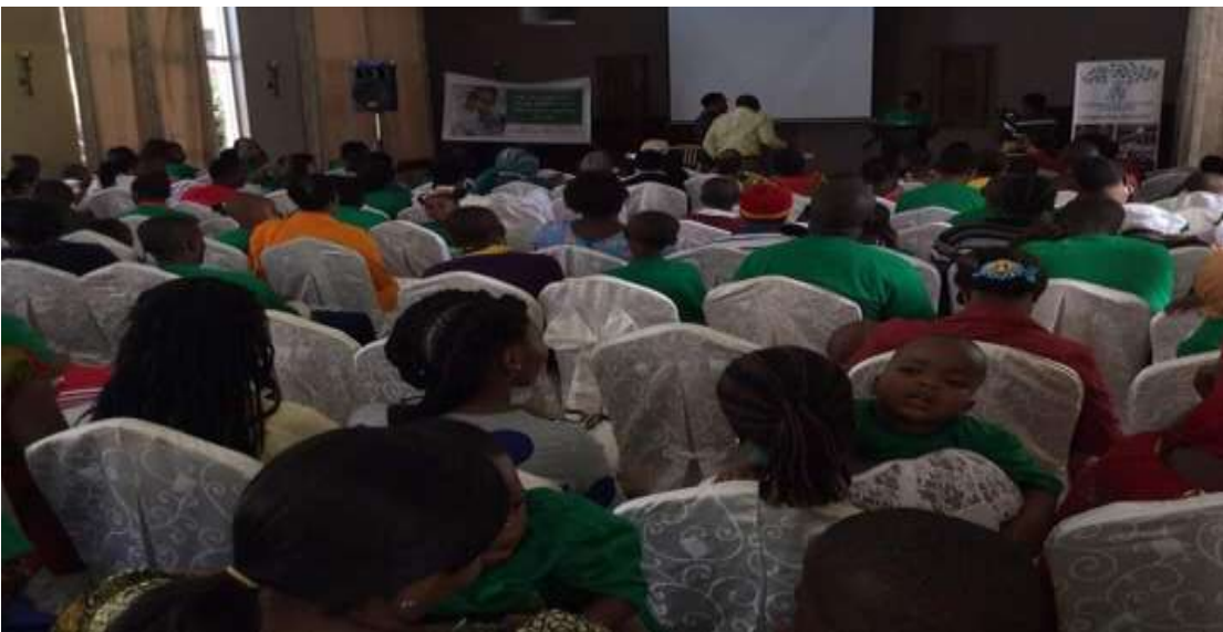
The audience at the CP and autism awareness seminar

OLET Co-Financed the Cerebral Palsy Awareness seminar for 150 families with the disability in Arusha so that parents of such Disadvantaged children and the public can play their role is helping them access education.