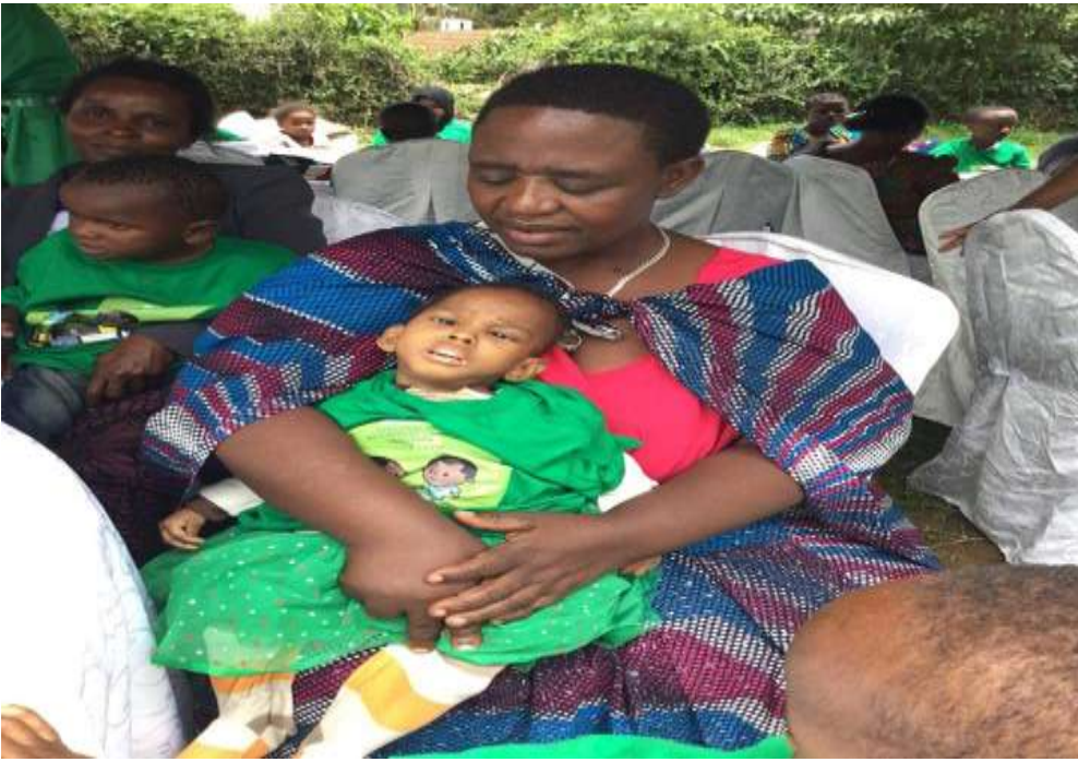
A mother with a child with Cerebral Palsy