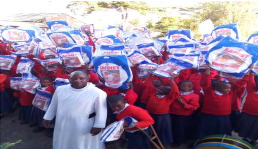
Mosquito nets distribution

In partnership with St Placide School in Sumbawanga, OLET distributed 300 Mosquito nets where school attendance was very low due to high prevalence of malaria.