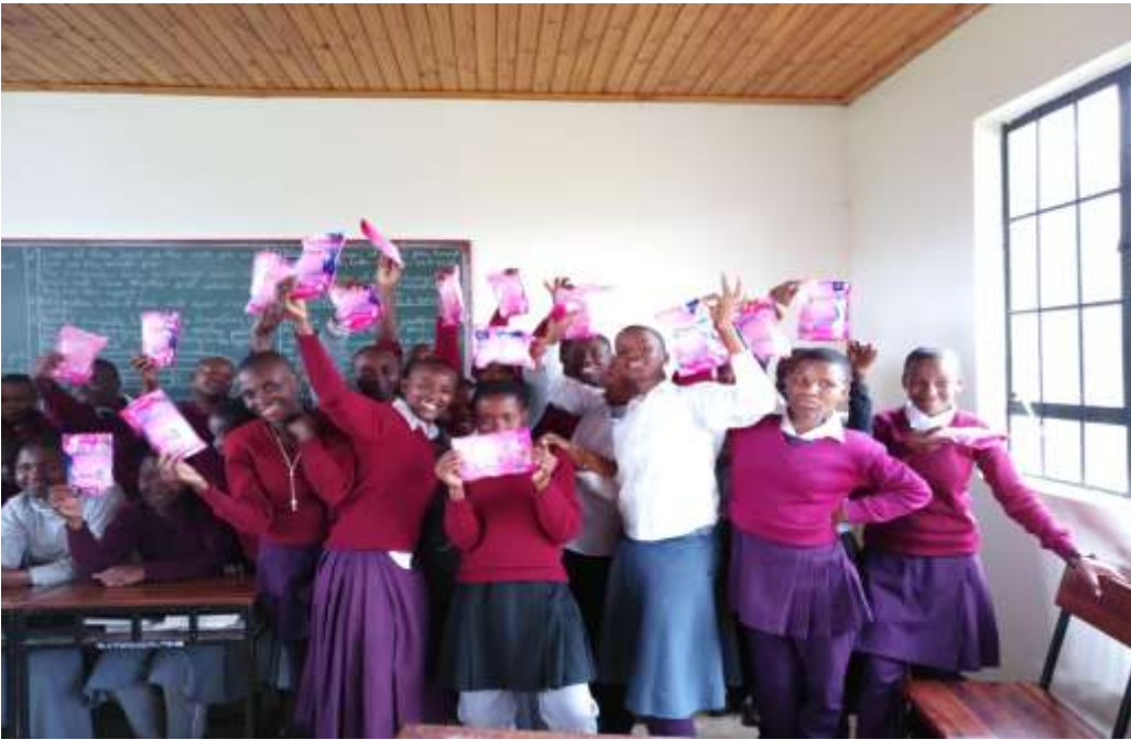
Sanitary pads distribution to adolescent girls